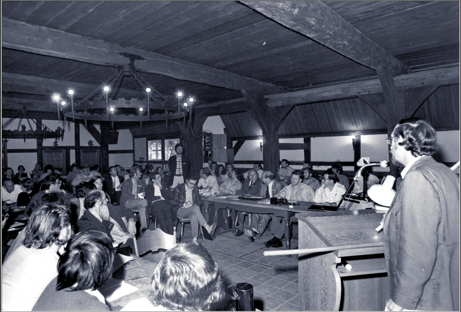
Modern Trends in Human Leukemia (Wilsede 1973)