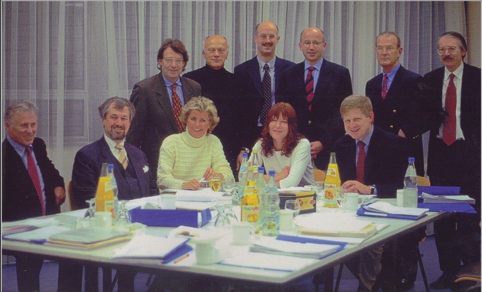
Steering Board of German Competence Network (1999)