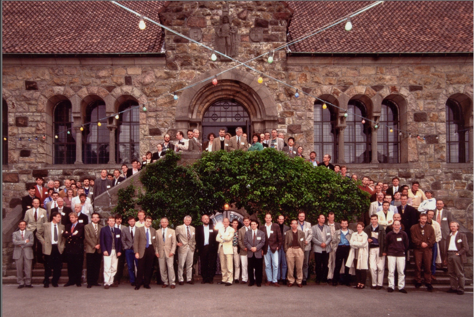
International Leukemia Workshop (Wachenburg 1992)