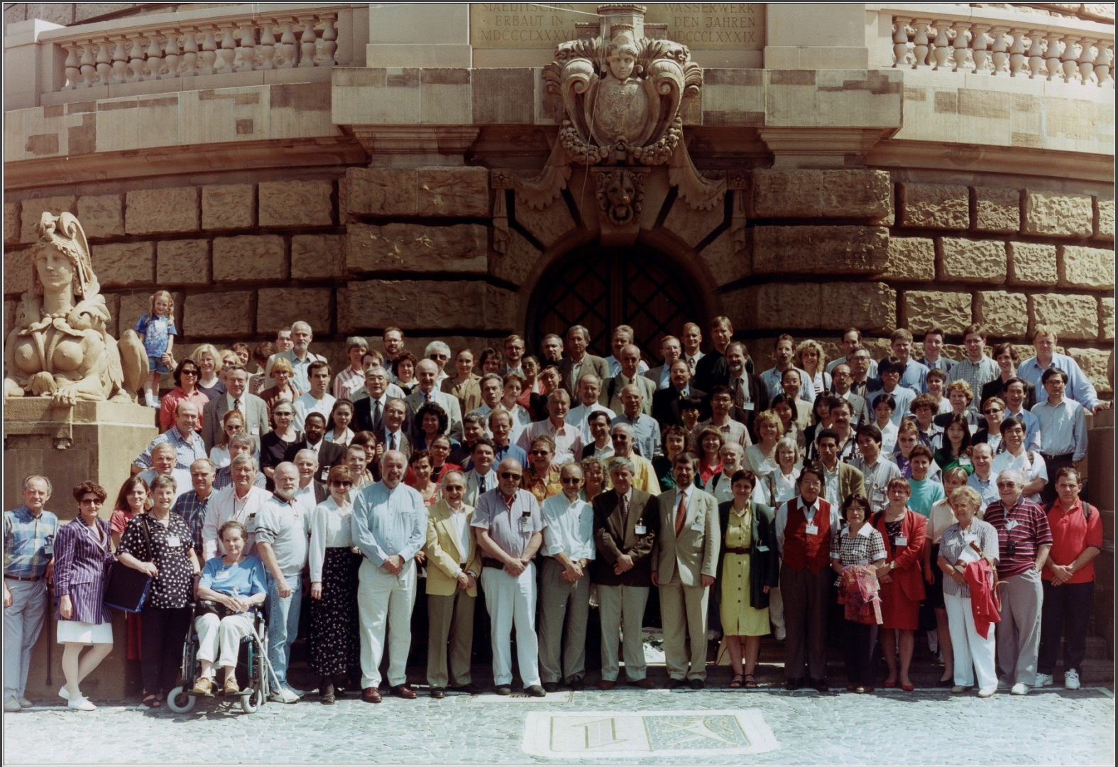
XIX. IACRLRD-Symposium (Mannheim 1997)